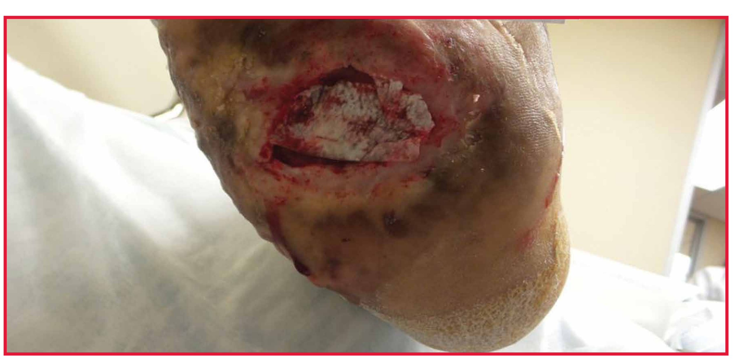
Application of CECM prior to NPWT