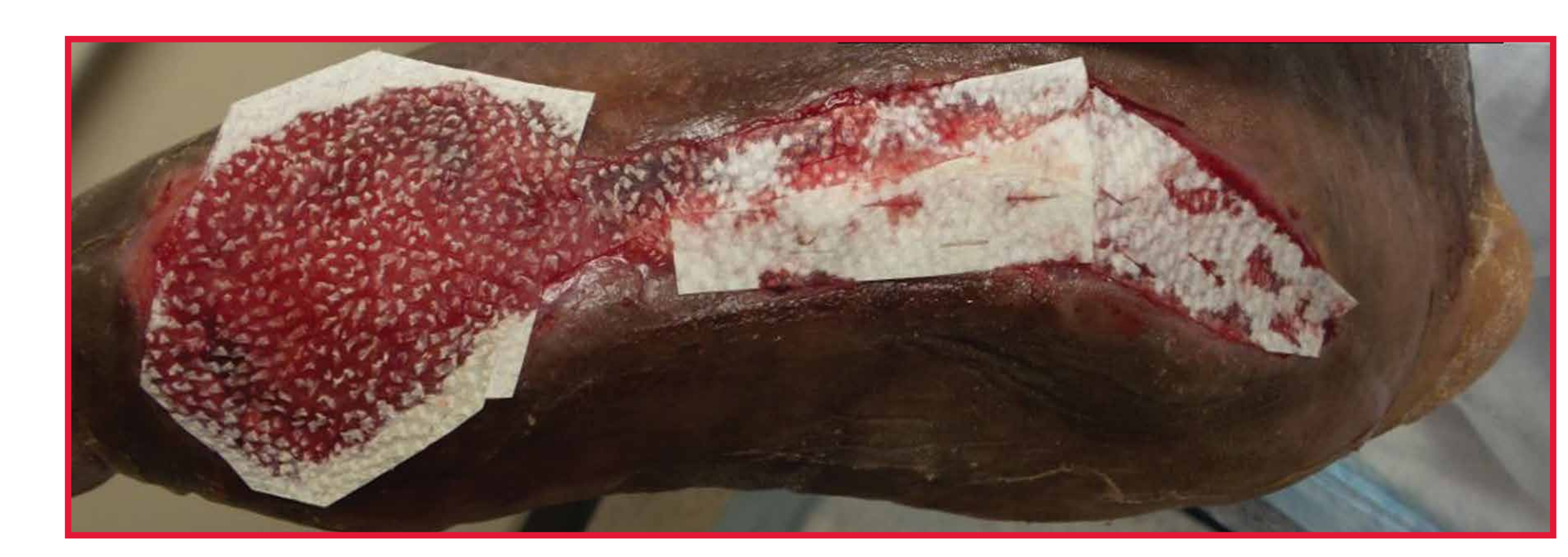
Application of CECM dressing